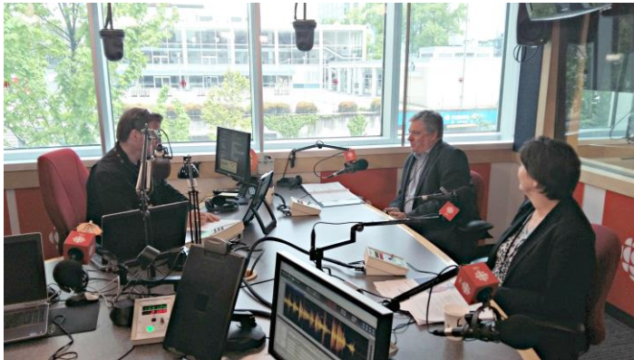
Interview with CBC Radio on WBSN Policy Position

Latest policy developed: “Encouraging and Supporting More Women on Corporate Boards”