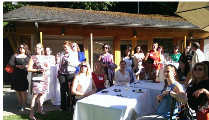
WBSN Summer Reception at the Hart House