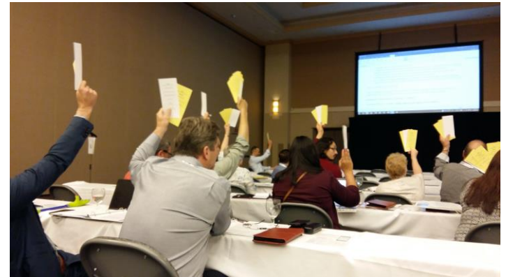
BC Chamber of Commerce Delegates Voting to Adopt WBSN Policy