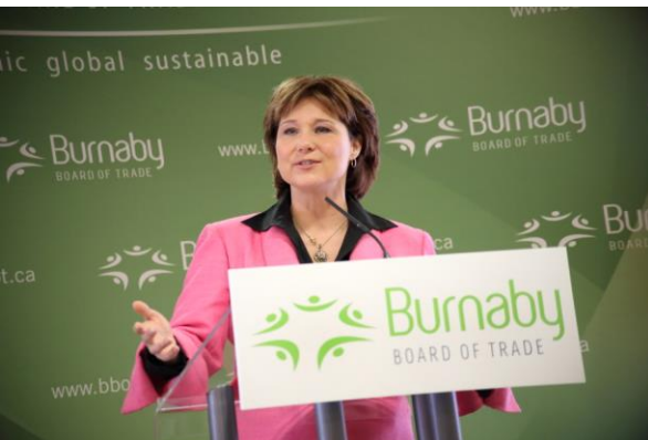
Women's Leadership Luncheon with Premier Christy Clark

Events developed by and tailored to women in business