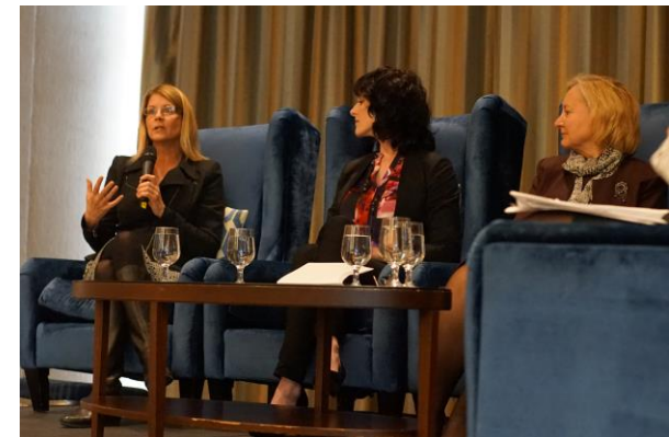
'Women Mean Business' panel discussion